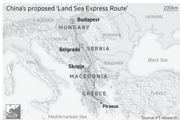
Figure 2: The Belgrade-Budapest high-speed railway