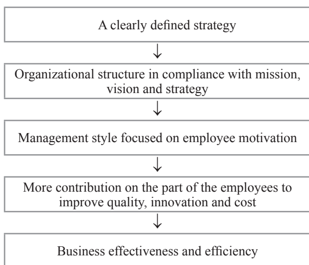
Figure 1: Prerequisites for generating efficient company operations

impact of organizational structure on the performance of companies. Summarized results have shown that companies with clearly defined strategies and organizational structures, as well as a leadership style focused on employee motivation, were more successful and efficient (Figure 1) [7], [27], [30], [41]. An efficient organizational structure has emerged as one of the key competitive advantages and an important factor in a company’s market success, especially if it is aligned with the company’s mission, its competitive environment and the resources available.