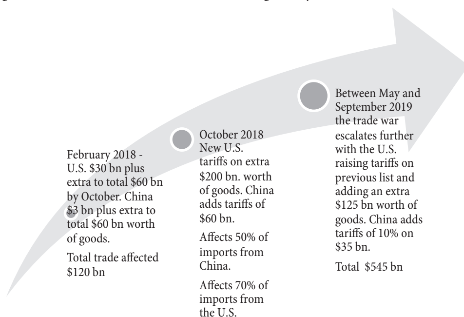
Figure 3: The escalation of tariffs on the worth of goods by the U.S. and China (2018-2019)

Furthermore, unless total foreign trade is conducted between two countries, trade deficits should not be considered as being bilateral. In that special case, tariffs would cut the deficit, raise government revenue, lead to loss of consumer surplus, raise producer surplus and create